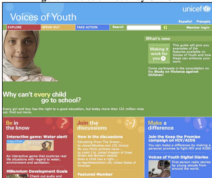
Figure 2: Voice of Youth by UNICEF

1997 for young people to interact with one another over the Internet. In addition to the discussion forum, the website also features an area where people can find out more in-depth information about various issues concerning child rights and development and also an area where people can take different action, online or offline, in their respective communities.